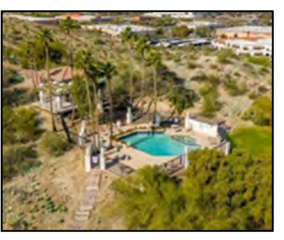
Vantage Pointe Pool

There are no lifeguards on duty; therefore, pool safety is the sole responsibility of the individual resident. Children under 14 years of age must always be accompanied by an adult and