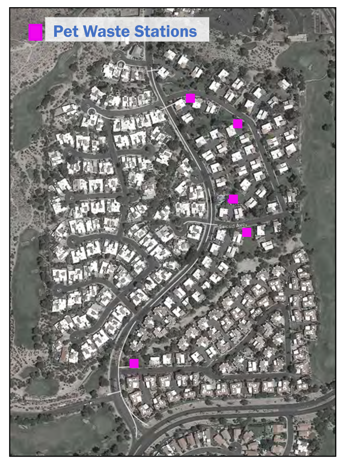
Page 21 of 24